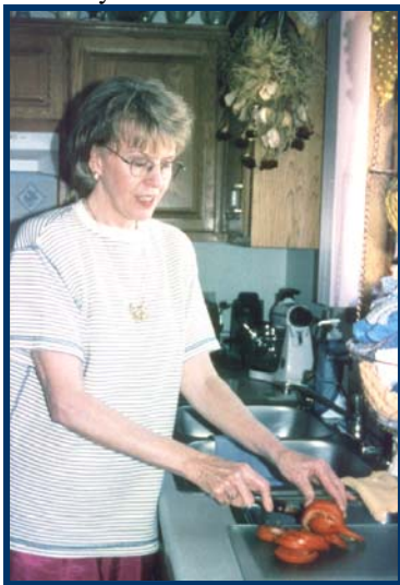
Chester Woods Park, MN

Utilizing the vacuum flushing toilet model allows flexibility in locating the BMRC instead of having to design the house or facility around the system. For existing homes that don't have basements, or for homeowners who don't want or have a location where an aboveground building can be located, an underground structure or concrete vault is recommended. The structure can be insulated and heated for cold climate installations. In addition, maintenance personnel can easily service the systems without having to enter the home. Locating the systems outside the home maintains that "out of sight, out of mind" mentality for wastewater treatment.