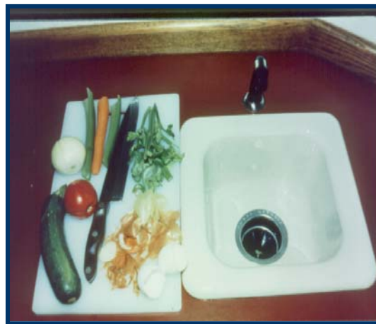
Ceramic Bar Style Sink with Garbage Disposal