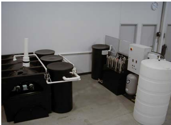
Complete System Displayed at Manufacturing Facility

A new proprietary treatment process, called separation technology wastewater treatment, has the ability to serve as a viable, long-term alternative to on-site and centralized wastewater facilities, for residences and commercial properties.